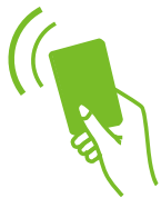
Access Control System

Our Pro series tripod turnstiles represent classic and safe way to protect your premises. They are used in various indoor environment applications. They fit perfectly as an economical option in the office buildings and other related applications.