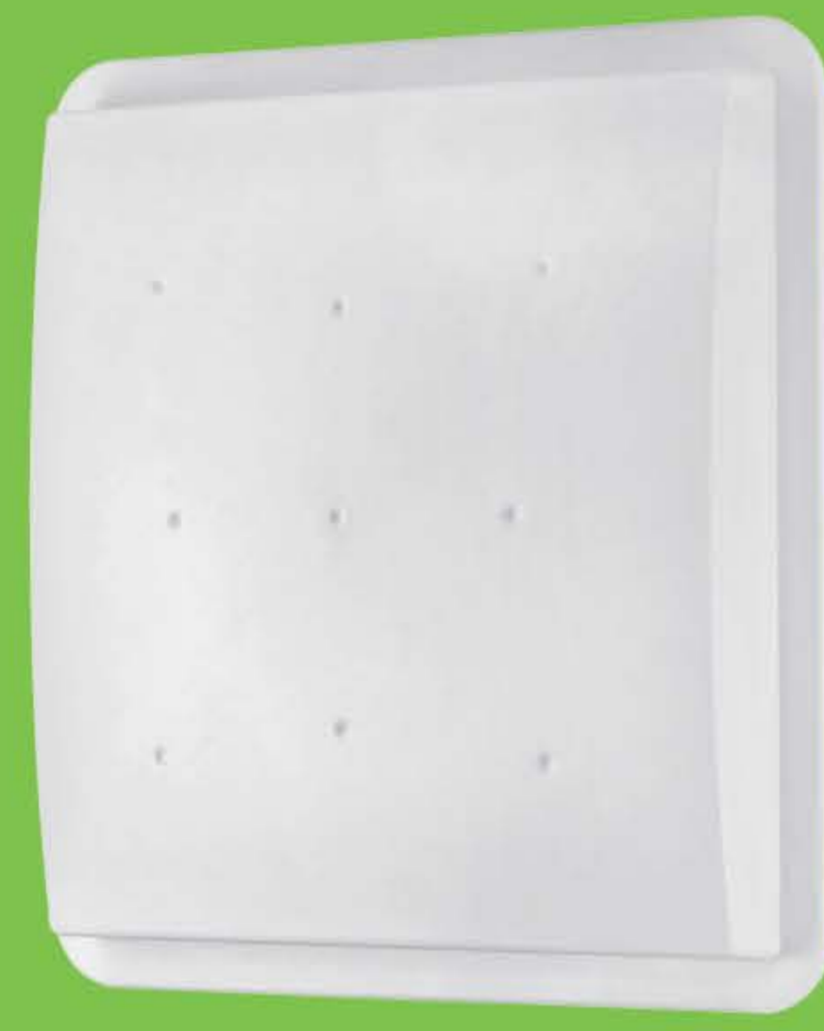
UHF 5 series