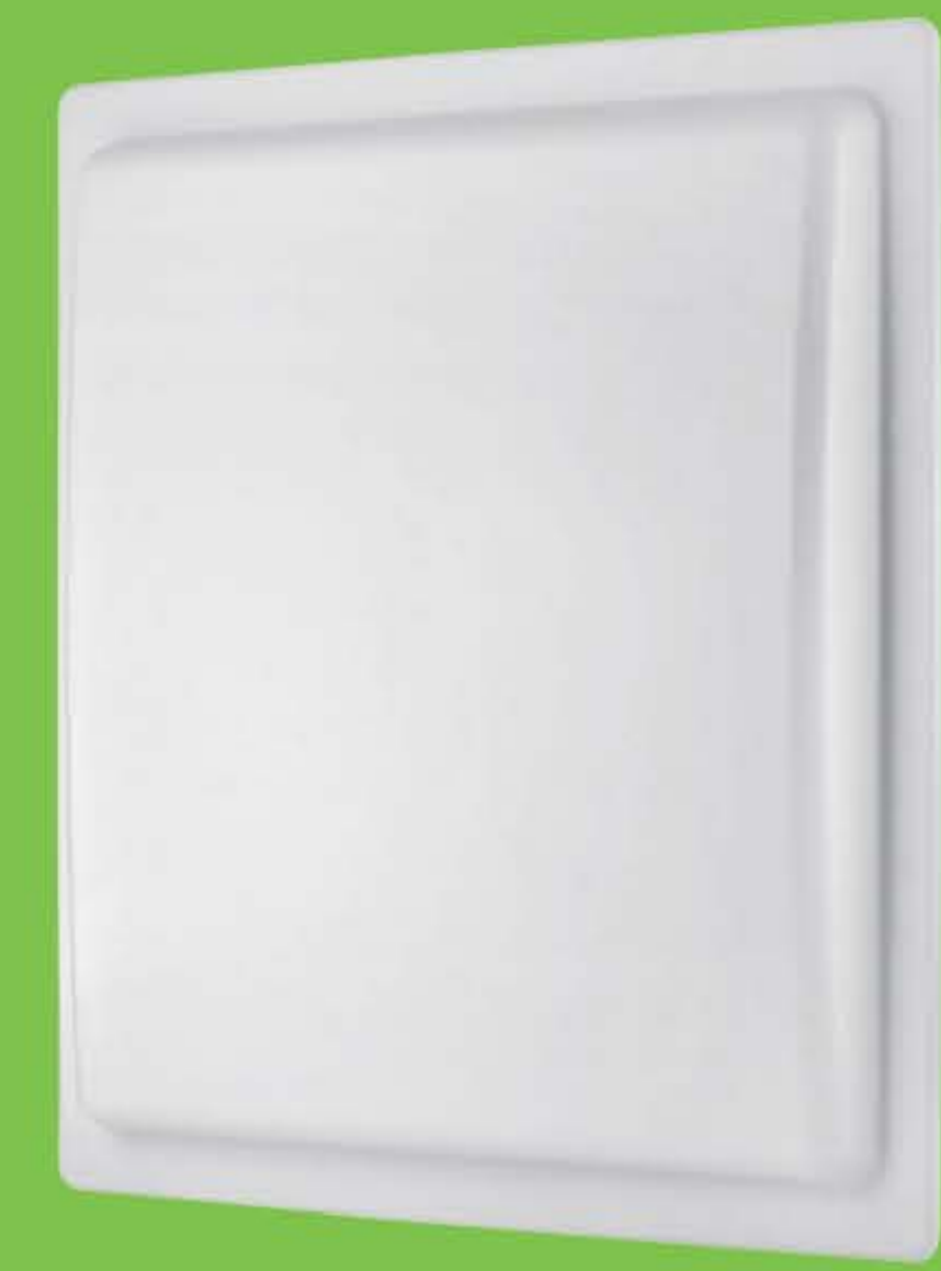
UHF 10 series